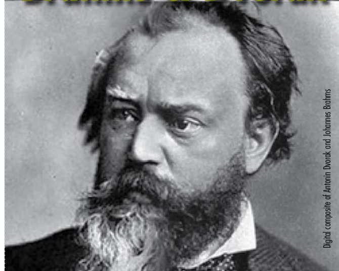
Digitl composite of Antonin Dvorak and Johannes Brahms

Nonprofit Organization U.S. Postage PAID Richmond, VA 23232 Permit No. 214